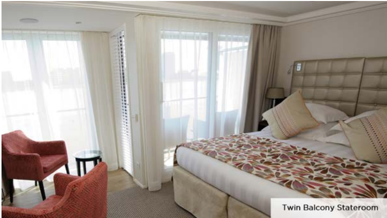
Twin Balcony Stateroom

7-night cruise | December 18-25, 2023 | Aboard AmaMora